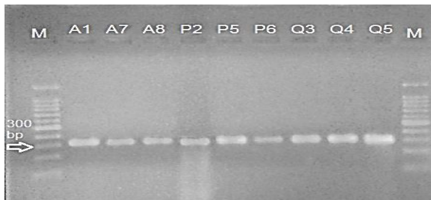
Figure 1- 318 bp bond related to specific planF primer in L. plantarum PCR product electrophoresis was formed. M; 100 bp marker.