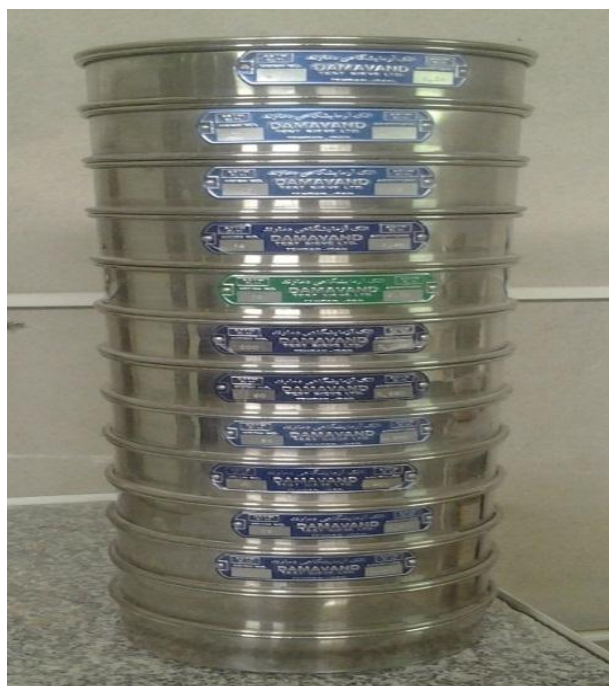
Fig. 1- Used columns of laboratory sieve in this study