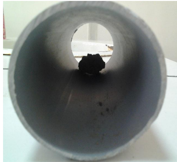
Fig. 2- Applied wind tunnel in this study